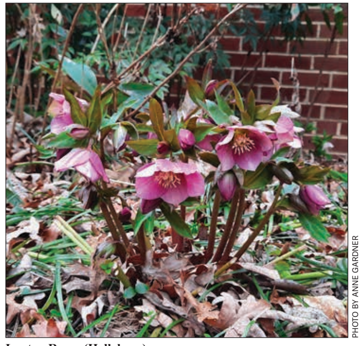
Lenten Roses (Hellebore)