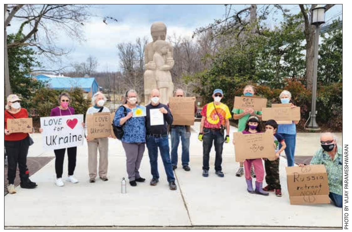
On Sunday, March 6, Greenbelters held a vigil in Roosevelt Center calling for peace in Ukraine. About a dozen people held signs against the war. It was part of an international day of action for peace in Ukraine. Similar calls to action also took place in Baltimore, D.C., Philadelphia, and internationally in Prague and Berlin. The next vigil is scheduled for Sunday, March 13 at 2 p.m. and Sundays thereafter for the duration of the war.