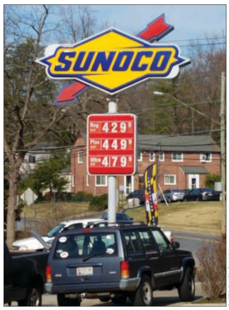
Gas prices are rising rapidly due to both inflation and the restrictions put on the purchase of oil from Russia after Russia invaded Ukraine.