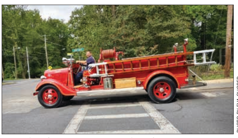
The antique fire truck takes a test drive before the parade.

Incoming County Chief Green closed the meeting by stating that she was "looking forward to working" with the city council.