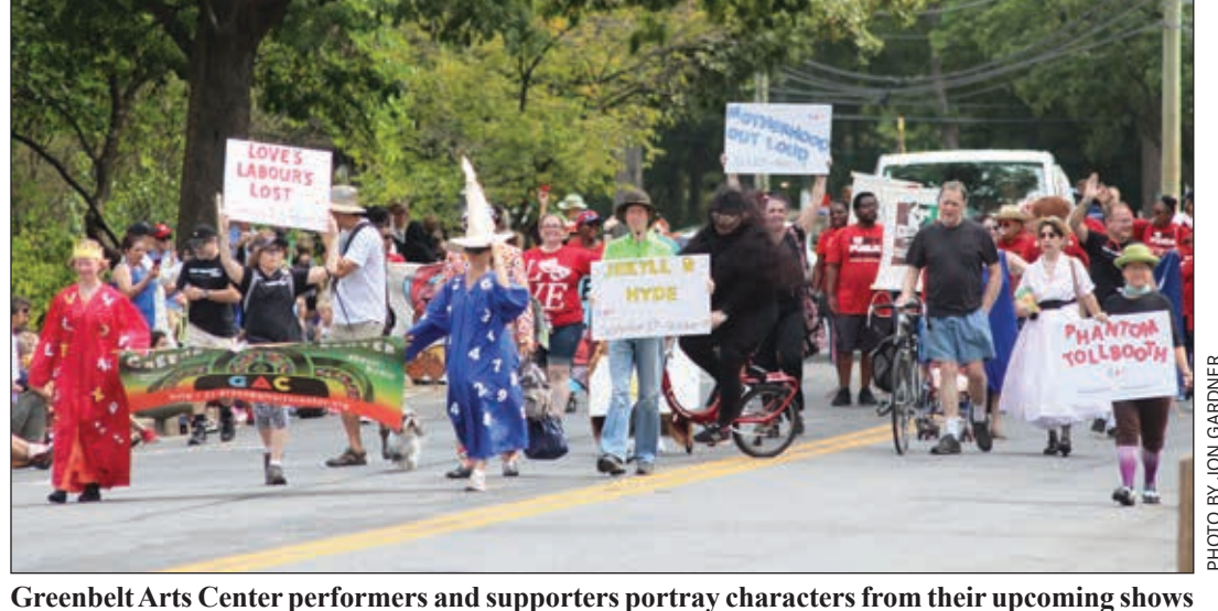
in the Labor Day Festival parade.

*apr-Annual percentage rate. Rate Based on credit. Rates subject to change without notice.