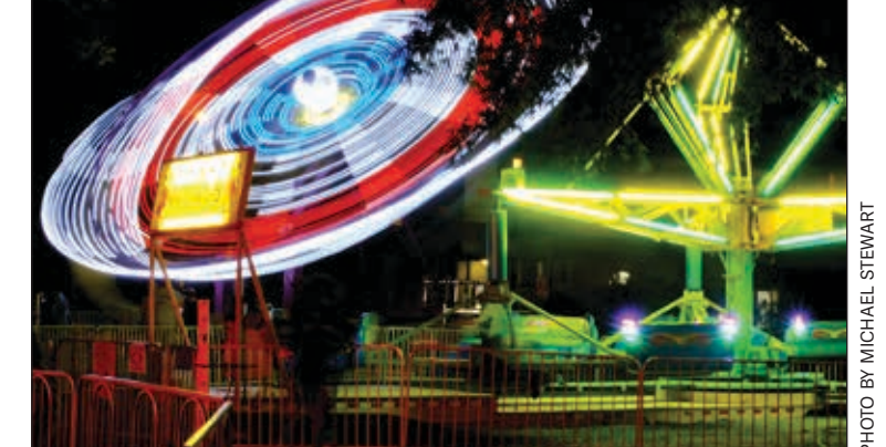
"The Sizzler" in action at the carnival