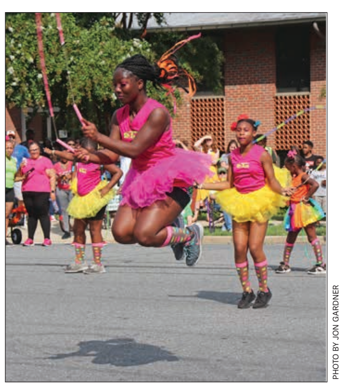
Greenbelt S.I.T.Y. Stars delight the crowd with their performance.