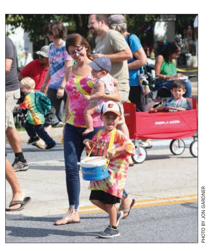
Members of Greenbelt Nursery School walk in the parade.