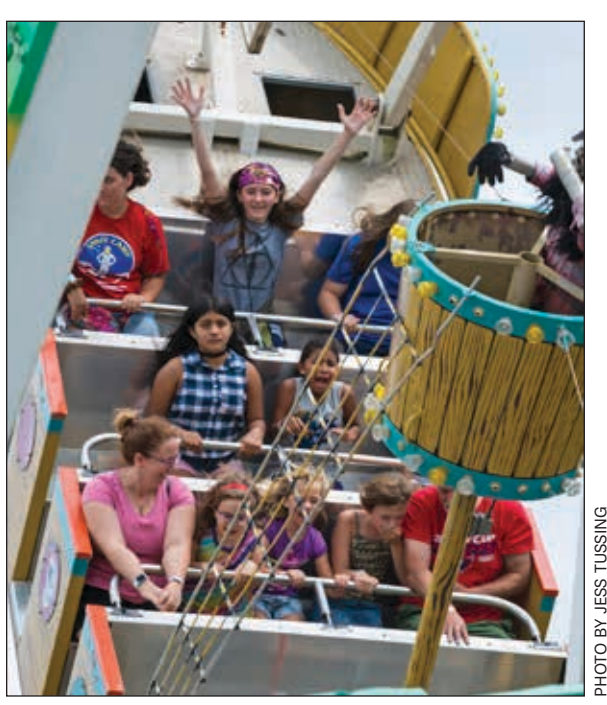
Kids and adults ride the Sea-Ray.