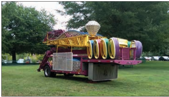
A carnival ride awaits unloading outside the Library on Tuesday morning.

The Golden Age Club will hold its annual Labor Day weekend bake sale and cookbook sale at the Co-op grocery store's outside ramp this Saturday, August 31 from 9:30 a.m. to 3 p.m. Proceeds will be used to help fund a child's scholarship to one of Greenbelt's summer camps.