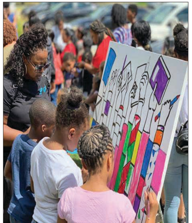
Participants at the Franklin Park Back to School Pep Rally take advantage of opportunities to be creative.