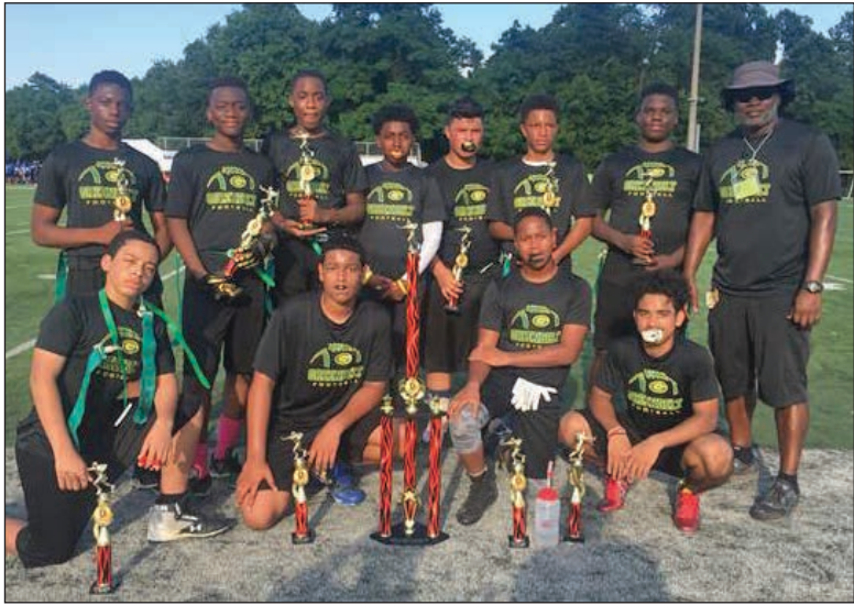
The Greenbelt Boys and Girls Club 14U Spring Football County Champions 2018