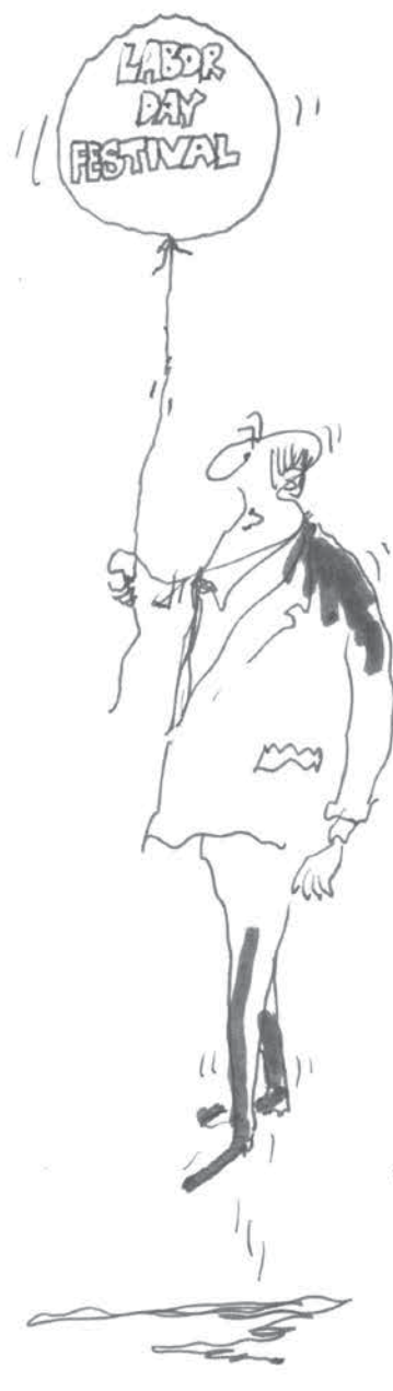
"Labor Day - This holiday lifts my spirits."

- Greenbelt News Review, August 28, 2003