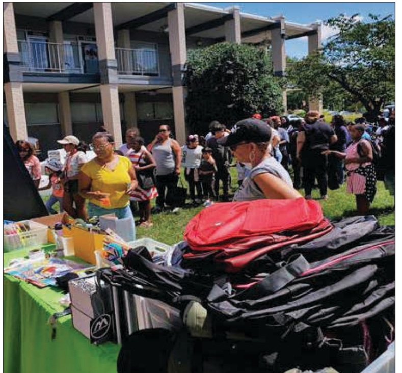
Greenbelters participate in Franklin Park's Back to School Pep Rally, held Saturday, August 24.