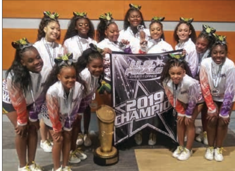
The Greenbelt Boys and Girls Club 2019 National Cheerleading Champions