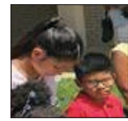
Franklin Park Event, p.11