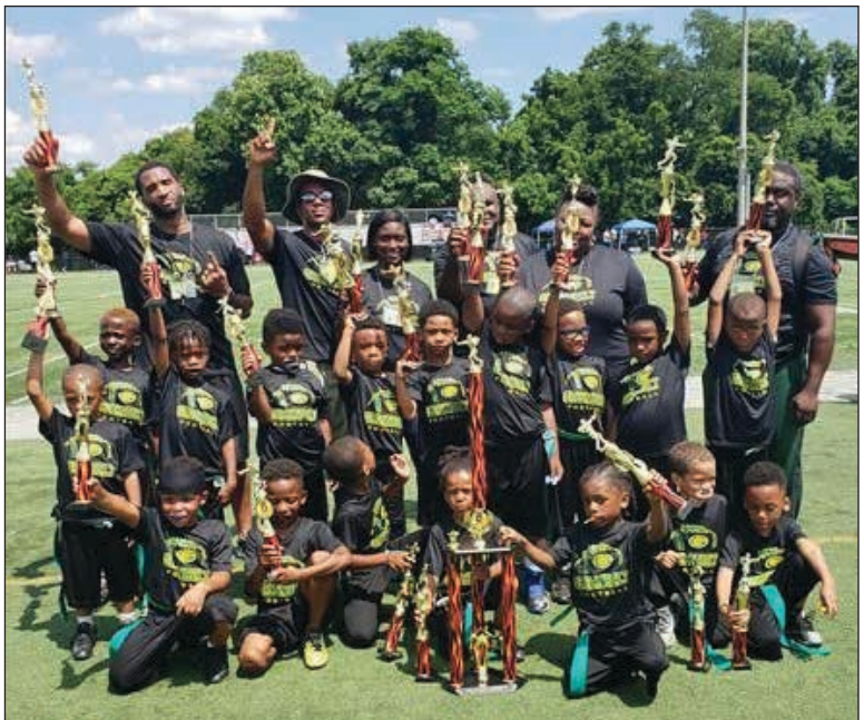
The Greenbelt Boys and Girls Club 6U Spring Football County Champions 2018