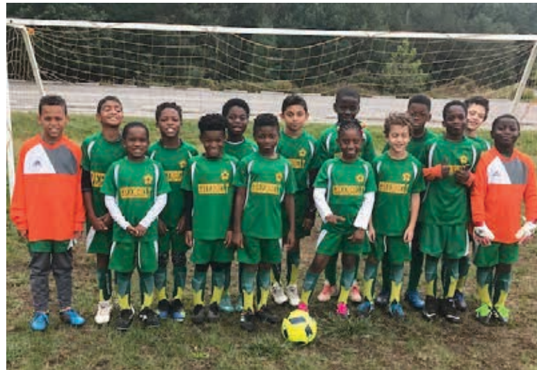
The Greenbelt Boys and Girls Club 6U Soccer team 2018