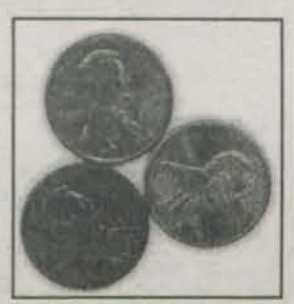
The tax rate is expected to increase 3 cents.

the equivalent of a five-cent tax rate increase under the old tax assessment system. This is after the revenues are netted for the cost of installing the cameras and paying for photo examination and issuance of citations. Councilmembers, particularly Edward Putens, hoped that the budget estimate could be increased, but after reviewing figures of revenues from other municipalities, decided that doing so could be risky. According to a city staff