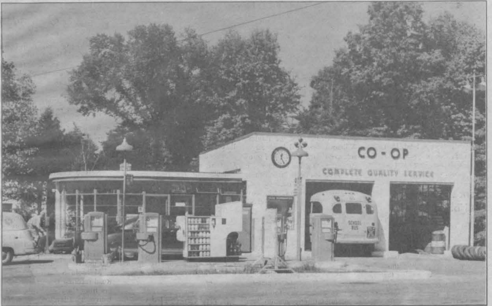
Two photographs that appear in this issue show early scenes of what is now the Mobil Gas Station on Crescent Road, opposite Gardenway. The gas station was built by the federal government in 1937 as part of the services provided to Greenbelt's earliest residents. The Friends of the Greenbelt Museum and the City of Greenbelt recently dedicated seven walking tour panels through-