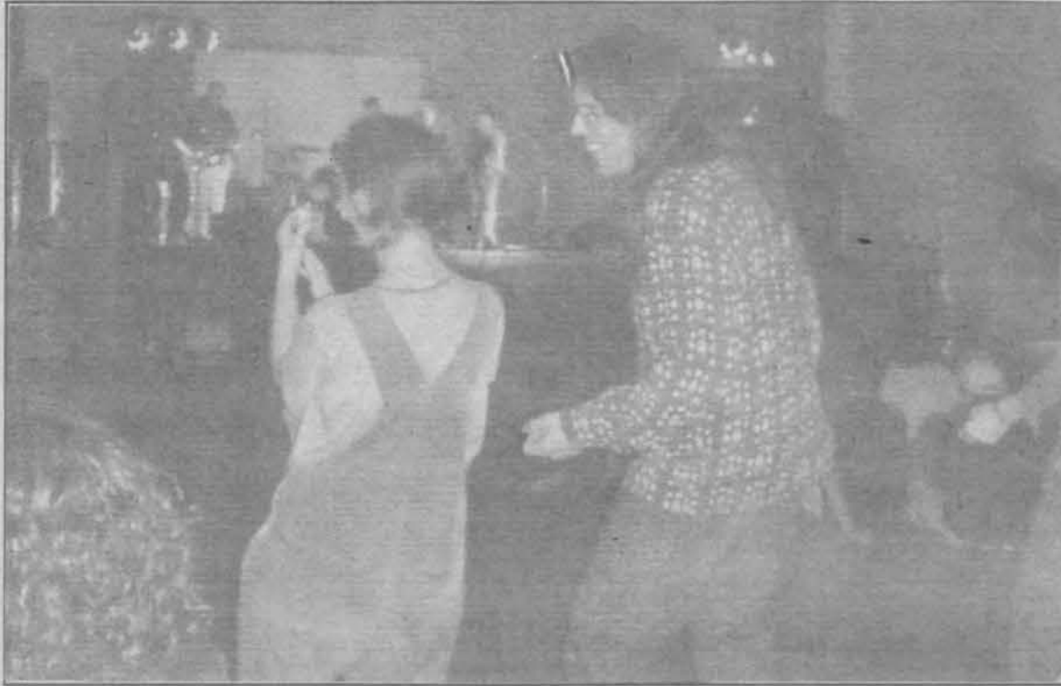
The two local bands that played at Saturday night's New Deal concert helped fill the gym with their young followers.