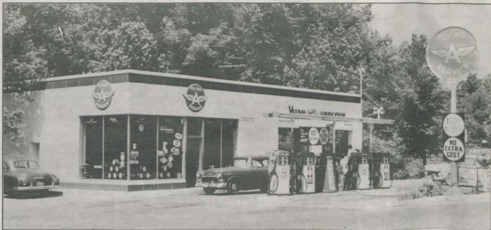
This photograph shows the old Co-op gas station, now Mobil, in the late '50s after the building had been renovated.

Eight out of every 10 people will suffer from back pain at some time in their lives. For the lucky ones, relief is accomplished by a period of rest. Washington Adventist Hospital (7600 Carroll Avenue, Takoma Park) will conduct a free back care seminar on Wednesday, March 14 at 7:30 p.m. Professionals will cover the anatomy of the back, causes of back pain, ways to prevent back injuries, and knowing when to seek professional help. Advanced registration required. Call 1-800-542-5096.