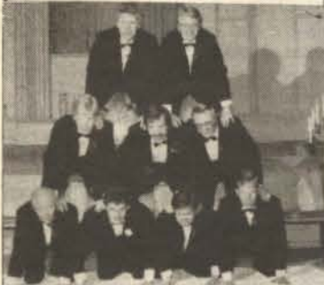
Elegant Wedding Photography and Video in the Belle Point Office Park

HOUSEMATE , non-smoker, furnished house, linen, utilities, maid service, own bath, TV, and phone, new house, Greenbelt Woods. No couples. $450/mo. Call 794-7336.