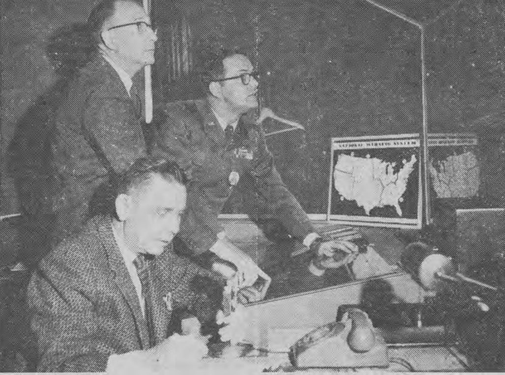
OCDM, Air Force officers at work in NORAD headquarters

1941, consisted of five mobile radar sets. Their limit of detec-tion, about 130 miles. Liaison with civil defense-none. Personnelnewly-trained in radar operation. Alert status at moment of attack-in midst of training exercise, officially alerted only to possible sabotage. No air attack alert in effect. Contact with pub-lic information media—none. Warning time between moment of attack and first widespread public warning-50 minutes.