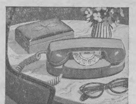
In the living room

Anywhere in your home that you want the convenience of an extension, you can now have a beautiful decorator piece at the same time.