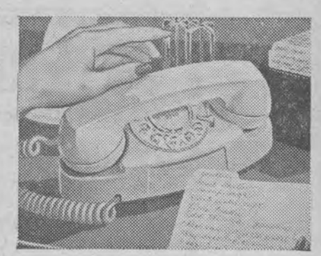
In the kitchen