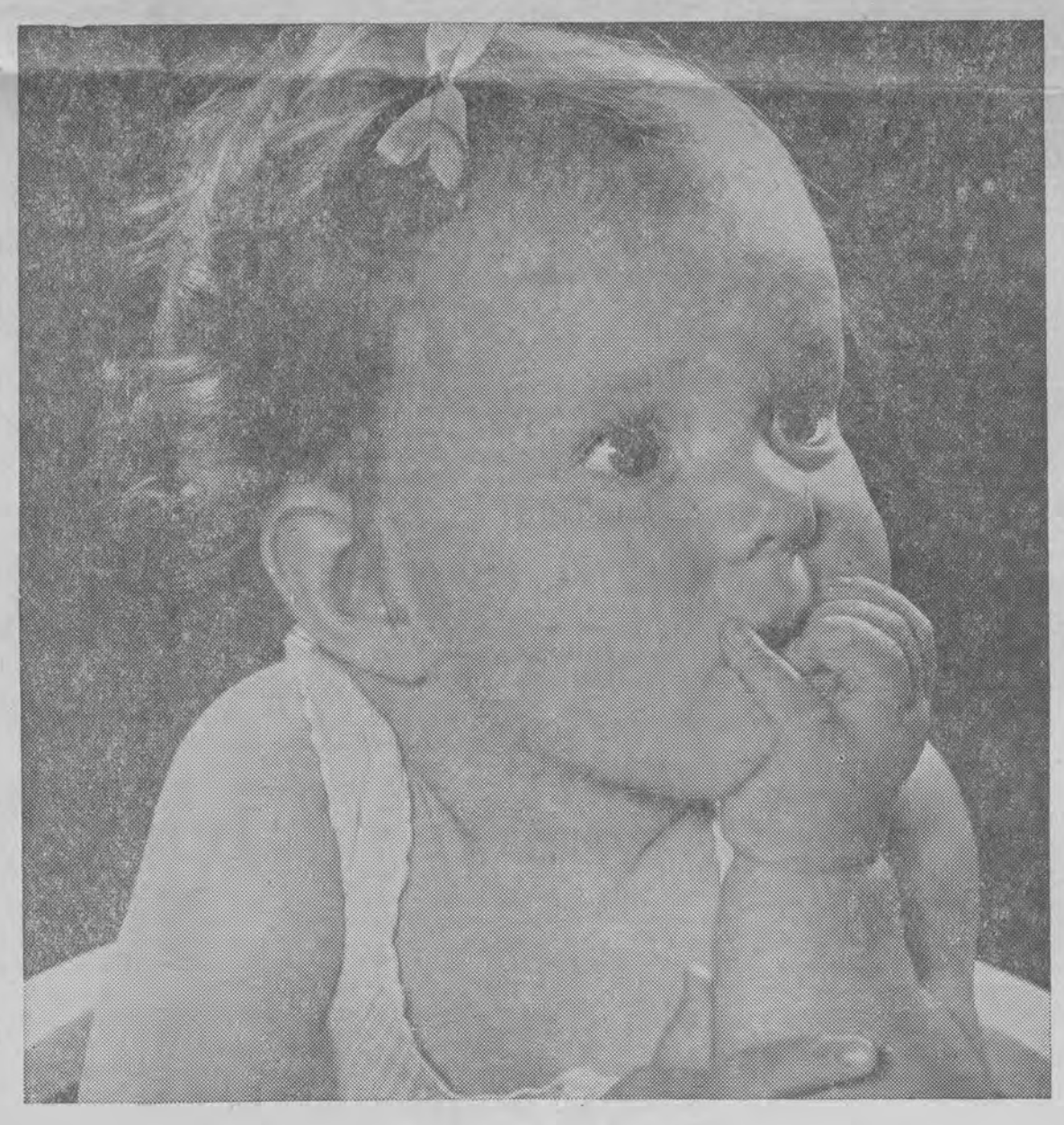
"Won't he ever call?"

Stop biting your nails, your boy friend may be trying to get you now! Of course, if someone forgot to replace the receiver after a call, your telephone and all others on the party line are out of service. When you hang up after each call, be sure that your receiver is not caught on a book or other object. A little care pays off in better service for you and your party-line neighbors. The Chesapeake & Potomac Telephone Company.