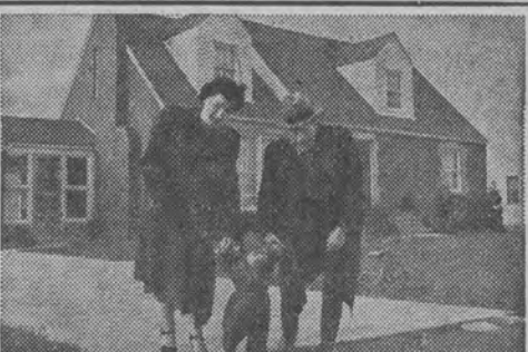
"We've saved about $3,500 in bonds altogether, leaving a nice nest egg even after putting $1,500 of it into the down payment on our new home. Bonds are a wonderful saving method!"