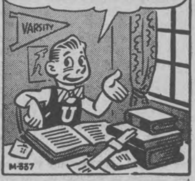
For full information contact your near VETERANS ADMINISTRATION offer

REMEMBER, VETS! IF YOU GO TO SCHOOL UNDER THE NEW KOREAN GI BILL YOU'LL GET A MONTHLY ALLOWANCE CHECK FROM VA ... BUT YOU MUST PAY FOR TUTTON FEES, BOOKS SUPPLIES, LIVING COSTS, ETC.