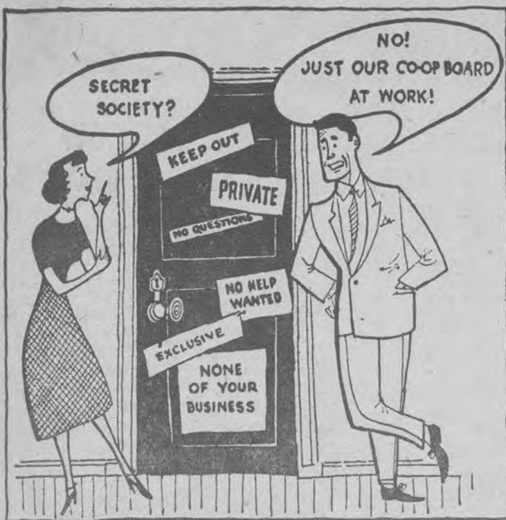
(Reprinted from E.C.I. Cooperator)

GCS is holding a special board meeting in executive session tonight. Subject: future expansion.