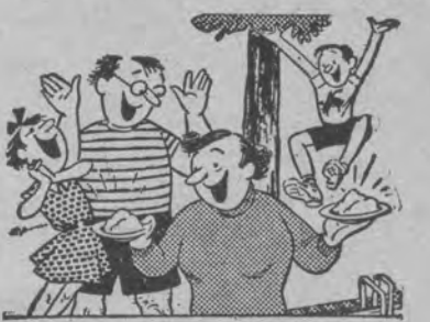
Cheer Up! Let Sealtest save the day!

Anytime, take time for Sealtest. Try "Lemon Flake," Sealtest Flavor-of-the-Month for July. Get the Best-Get Sealtest!