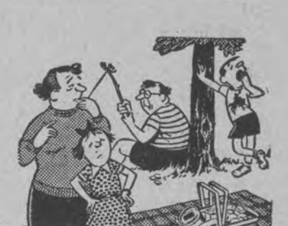
Picnic Doldrums from too much play?

The board of directors of Greenbelt Consumer Services held its regular meeting on Friday. July 8. Following a report from the auditing committee, the proposed area plan was discussed. ciency of depending upon the New York and Baltimore warehouses has been in question for some time. The proposed area plan would provide for a local warehouse. No final steps were taken in this direction at the meeting.