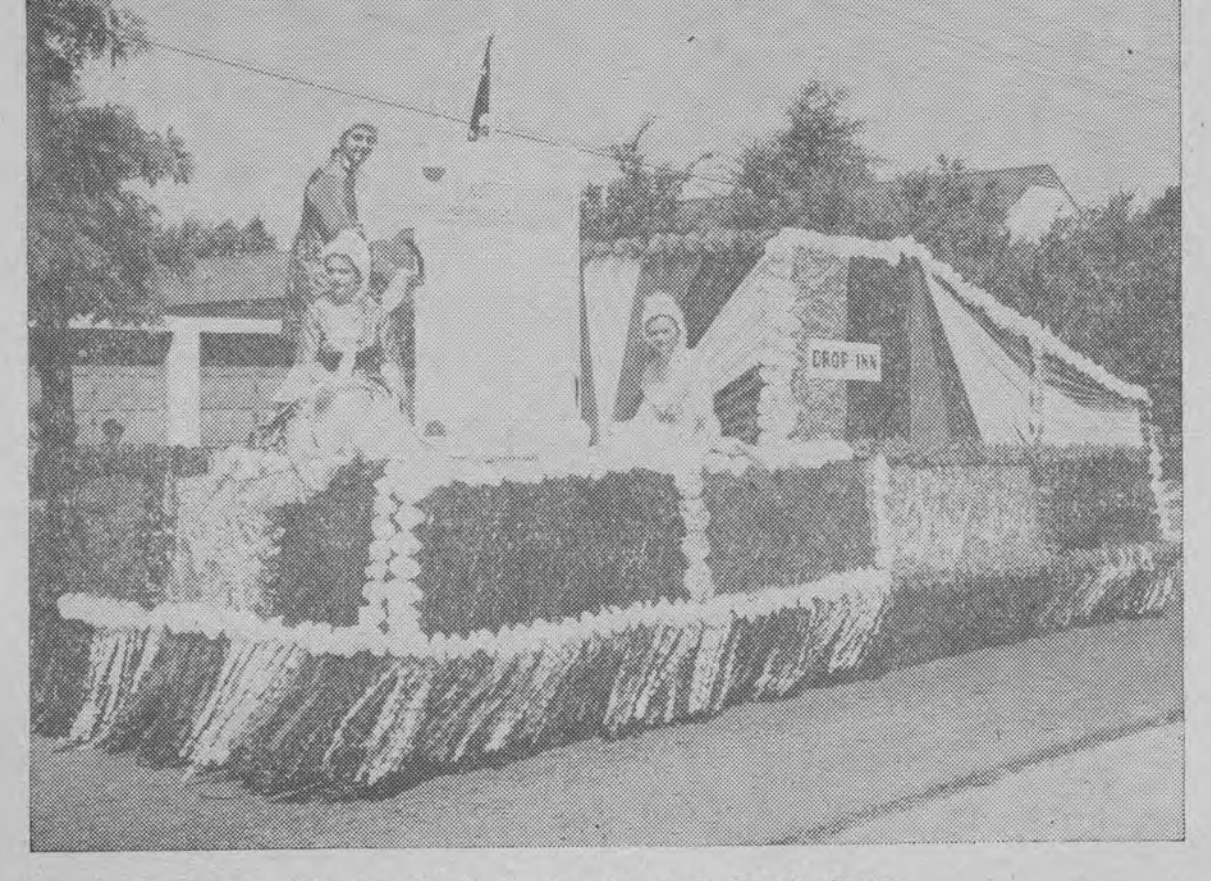
First-prize Winning Float of the Greenbelt Youth Center.

Beginning July 11 to 22, Monday through Friday, at Trinity Lutheran School, 38th and Longfellow streets in Hyattsville, school will be in session noon there will be Bible study, handicraft. songs, games, and educational, religious and comedy movies. The school bus will stop anywhere on Crescent Road for those going at 8:30 a.m. The school will end its activities with a picnic at Magruder Park on July 23. There will be no tuition charge, but a daily freewill offering will be taken to meet expenses. Come and play with us July 11 to July 22.