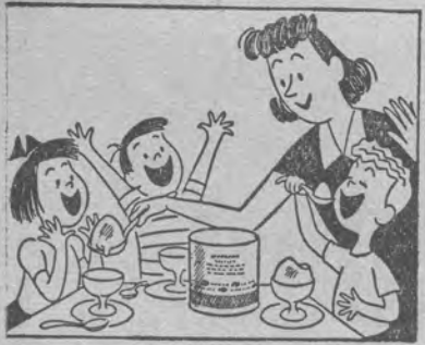
Be smart! Let Sealtest save the day!

Anytime is Sealtest time! Remember, too, Old-Fashioned Cocoanut Ice Cream, the Flavor-Of-The-Month for June.