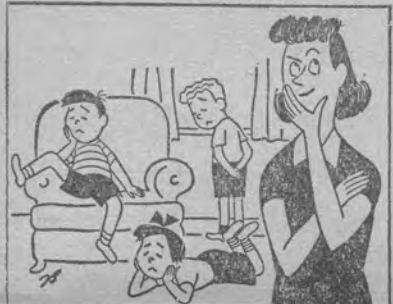
When children wilt, Too hot for play

HOME OFFICE - COLUMBUS, OHIO Affiliated with Form Bureau Mutual Fire Insurance Co. Farm Bureau Life Insurance Co.