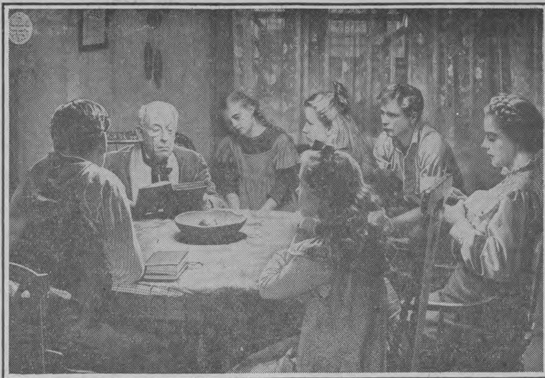
Coming—Irene Dunne in "I Remember Mama," Sunday and Monday, August 1-2

***** Although it hasn't come to Greenbelt yet, "Life With Father" was made long before "I Remember Mama," and the latter's advance presence is Hollywood's way of saying ladies first. ("Life With Father" played with advanced prices, of course.) My suspicious nature tells me that titles of this