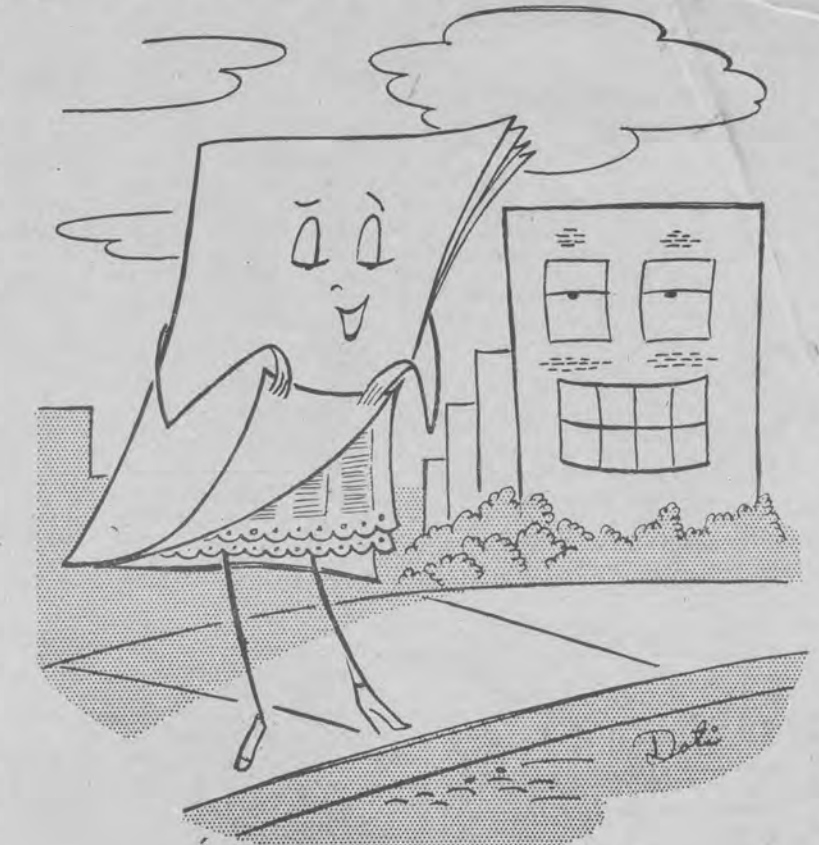
How Do You Like Our New Look?

There will be two more registration days this year, one each in September and October. Persons more than 21 years old who did not register at least six months ago will not be permitted to vote in the general election in November.