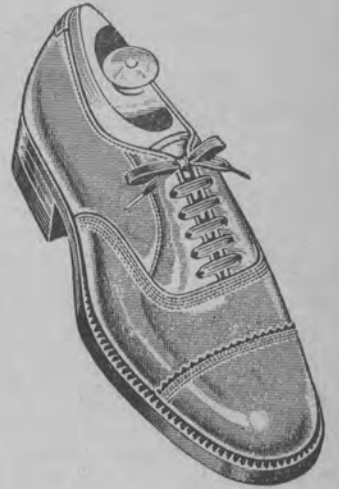
Men's Store FINE CALFSKIN $6.95 to $10.00

THURS., FRI. DEC. 4, 5 Dick Haymes - Celeste Holm Carnival in Costa Rica (Technicolor) 7:00 and 9:00