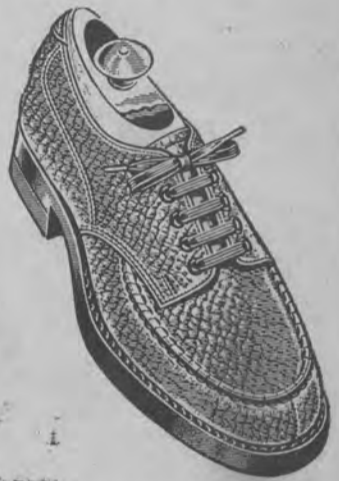
Boys' Shoes $5.95 to $6.95