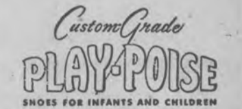
Children's Shoes $3.25 to $5.75