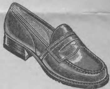
Teen Age Shoes $5.95