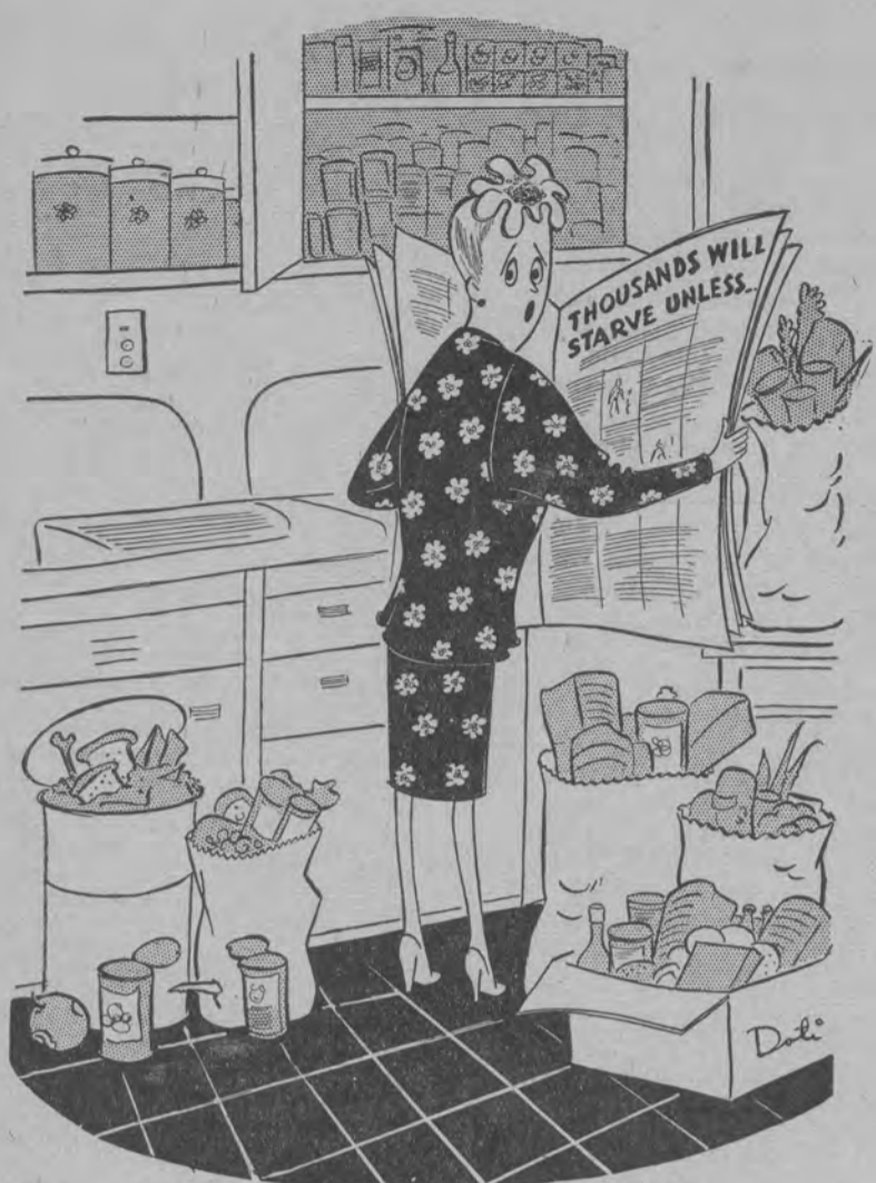
"O dear, I suppose I should give up eating between meals"