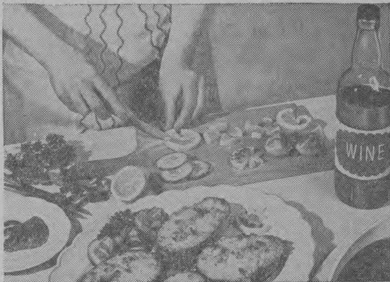
Salmon steaks are extra good served with a simple wine sauce. Fancy garnishes dress up the platter and are meant to be eaten.

Attractive garnishes and a superior wine sauce make ever-popular salmon steaks into a very special dinner dish.