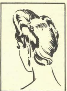
LEON OF LONDON