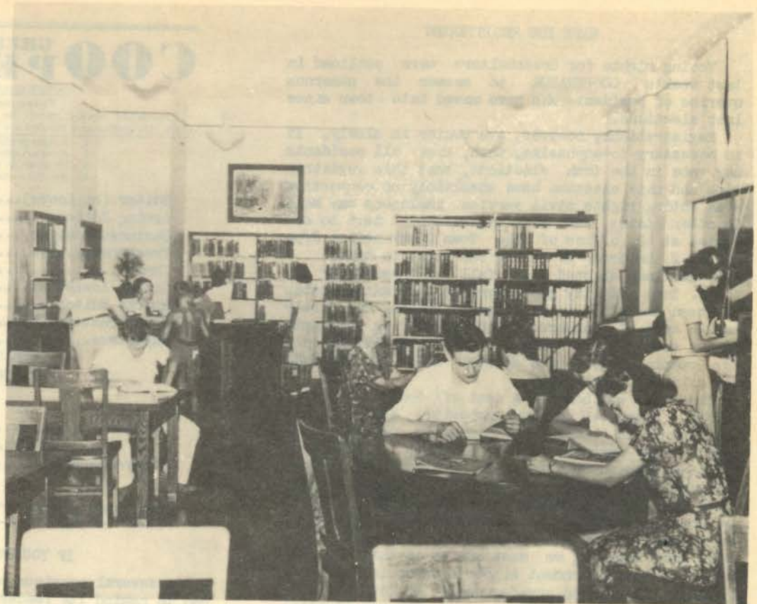
Staff Photograph (Mead)

Since the Town Library opened in June attendance has increased rapidly to take advantage of the fine selection of books provided. Here is a general view of the reading room looking towards the desk.