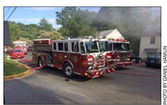
Fire departments from several local jurisdictions responded to the fire on Plateau Place.

Contractors working on GHI's Homes Improvement Program further up on Plateau Place were seen carrying lengths of either siding or 2x4s on their shoulders through the gauntlet of fire equipment, as Ridge Road at Plateau Place was completely blocked for over an hour.