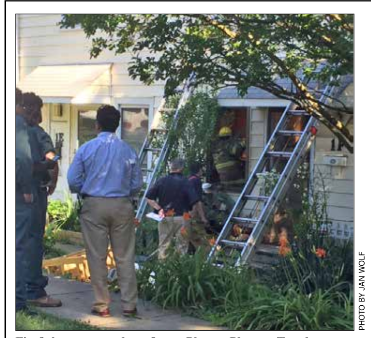
Firefighters respond to a fire on Plateau Place on Tuesday morning. See story on page 12.

The office will be open from 2 to 4 p.m. Sunday and 2 to 4 and 6 to 10 p.m. Mon-