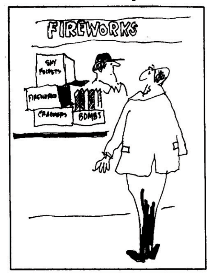
"I live in Greenbelt... Do you have any that burst into silence?"