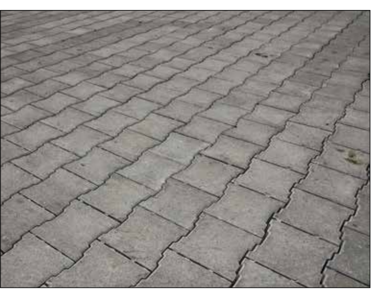
Close up of permeable parking lot at Springhill Lake Recreation Center

Thankfully, there are many opportunities for property owners to combat stormwater pollution. Whether one plants native trees, installs a rain garden or rain barrel, these efforts serve to capture and slow down the rate and volume of stormwater pollution from entering storm drains, rivers, streams and lakes. These small individual actions lead to big community impacts that ul-