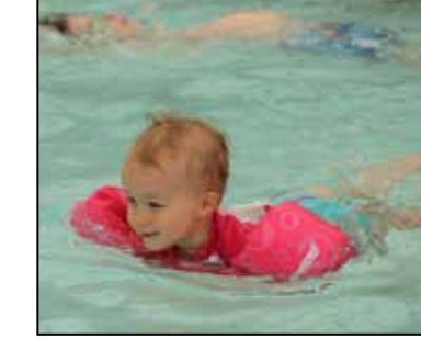
the Underwater Easter Egg Hunt on Friday.