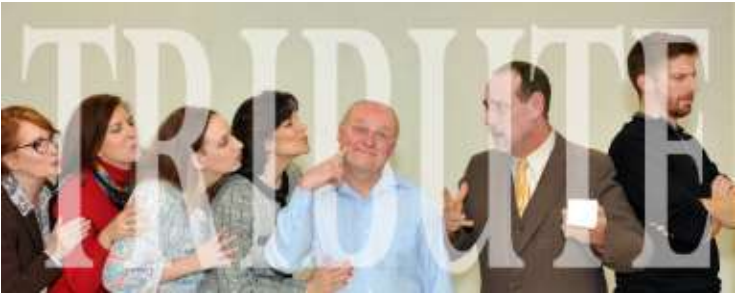
April 21, 22, 28, 29 & May 5, 6, 12 at 8:00pm Matinees April 30 & May 7, 13 at 2:00pm

Check out our Channel on Comcast 77 and Verizon Fios 19 To view our schedule, visit: www.greenbeltaccesstv.org And click on "Channel"