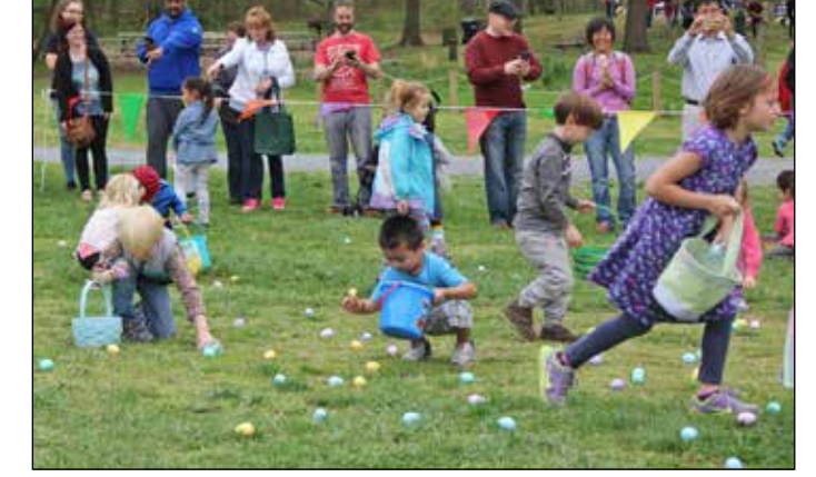
Kids gather the eggs at the Easter Egg Hunt at Buddy Attick Park on Saturday.