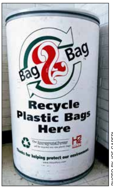
White bins for plastic bag recycling are at each entrance to Co-on.

The Co-op thanks those who support Greenbelt's member-owned supermarket and pharmacy. It is only through their patronage that the Co-op can continue to serve its members and the community.