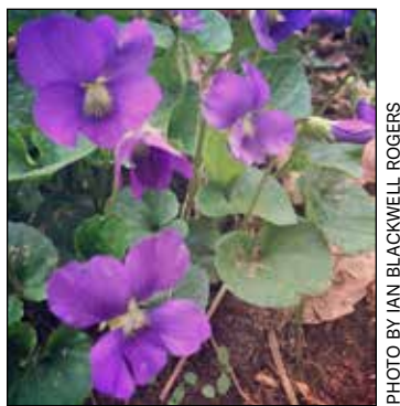
Violets in bloom

The 14th annual antique and used Jewelry Sale of Mishkan Torah is scheduled for Sunday, April 30, from 11 a.m. until 3 p.m. This will be a good time for children and adults to find "treasures" for yourself or in time for Mother's Day gifts. Prices begin at less than a dollar, so there will be something there for everybody's budget.