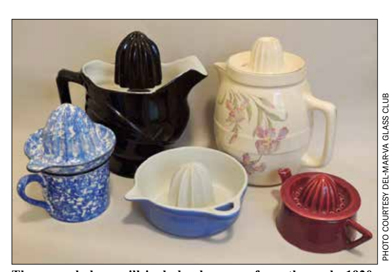
The annual show will include glassware from the early 1920s through the mid 1980s.

Reamers (or juicers) have been around for almost 250 years. Originally made in 18th century France, reamers showed up in America in the late 1800s. In the 1920s reamer production blossomed when the Sunkist Fruit Growers Exchange used glass reamers as giveaways to entice people to buy their fruit.