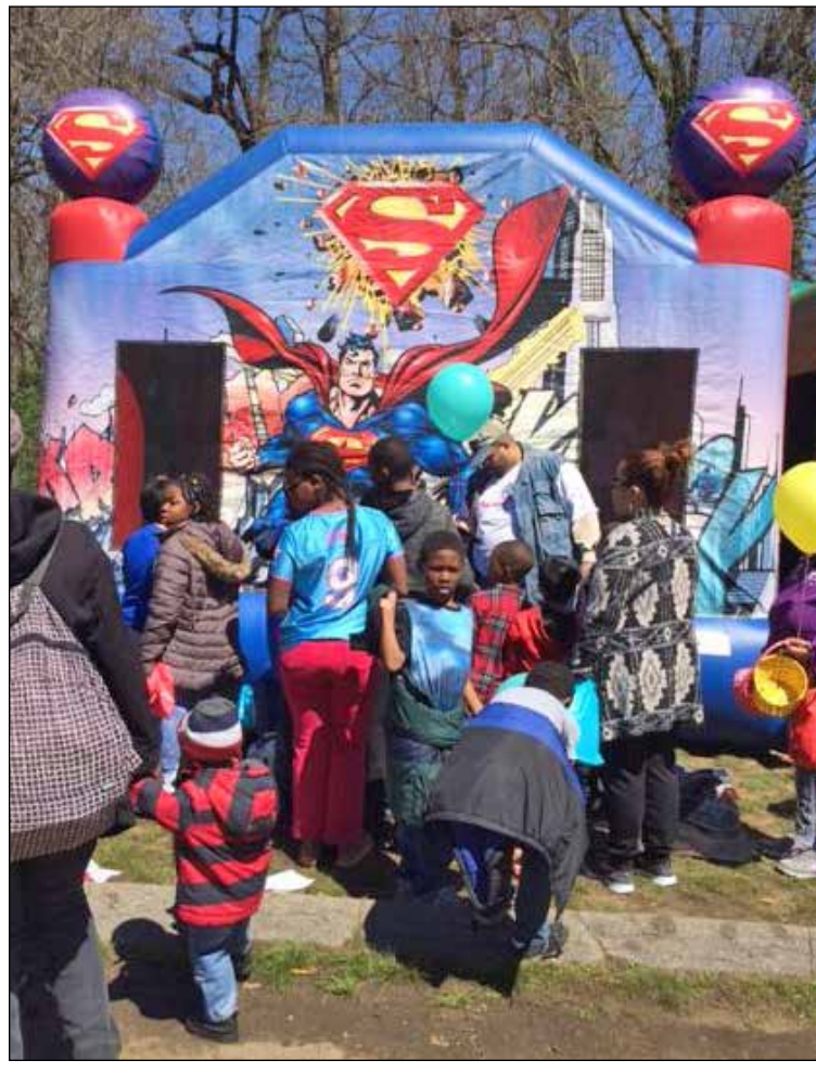
SHLES students and friends cluster enthusiastically around the bounce.

Springhill Lake Elementary School serves approximately 850