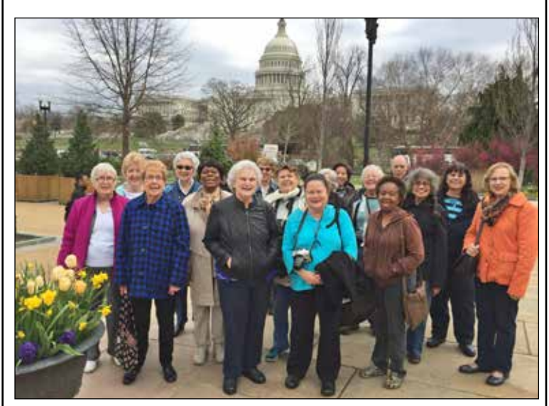
Seniors enjoy their visit to the U.S. Botanic Gardens as part of the Senior Globe Trotting Trip.