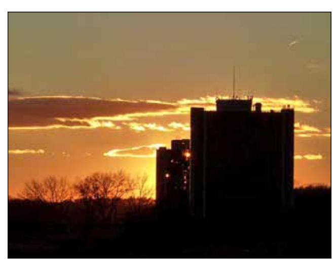
Sunset over Greenbelt, near Eleanor Roosevelt High School