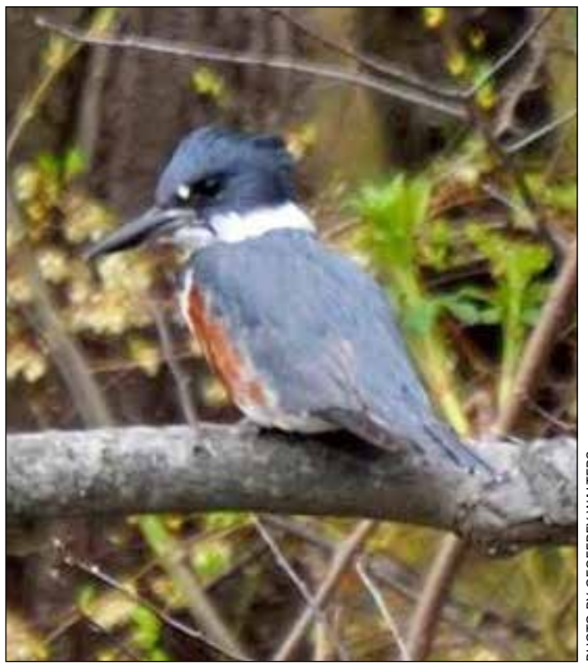
Belted Kingfisher at Greenbelt Lake