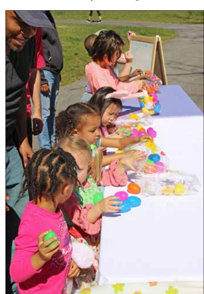
Kids count their eggs and have the numbers recorded, prior to receiving a bag of candy as a prize.