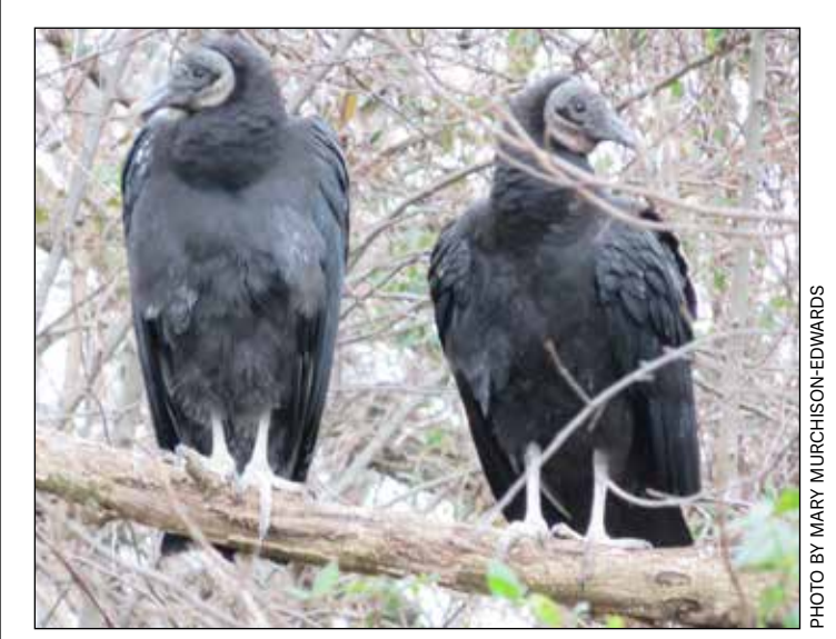
Two black vultures perch above Greenbelt Road.