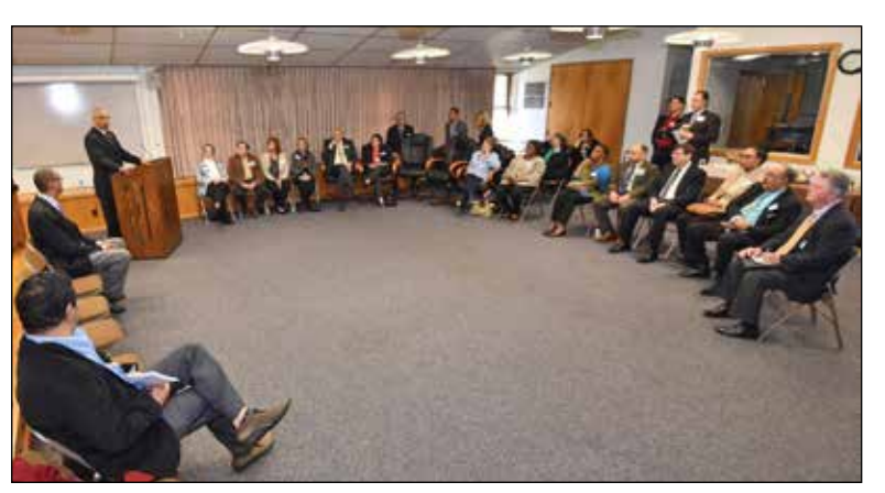
Greenbelt council and stakeholders met for a Business Breakfast on March 30 in council chambers.