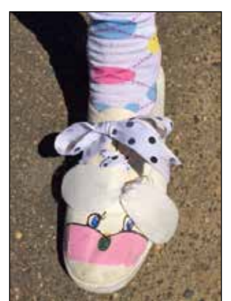
A student shows a nifty pair of bunny slippers all set for spring.

Franklin Park is a community of approximately 2900 families in Greenbelt West.