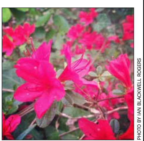
Azaleas are starting to bloom in Greenbelt yards.

So, relax and enjoy the first fully technicolor paper - with more to follow