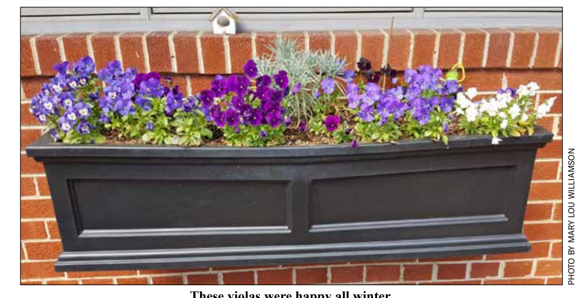
These violas were happy all winter.