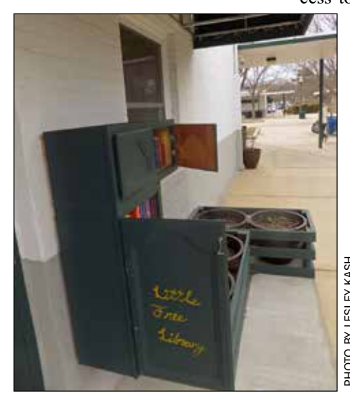
Little Library outside MakerSpace in Roosevelt Center

The libraries come in different shapes, colors and sizes and many resemble tiny houses. They can be purchased online or built at home. Some are even deco-