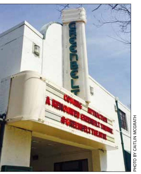
Old Greenbelt Theatre

Many Greenbelters have said they want the theater to show more first-run films. In fact, Mc-Grath says, all of the new films at the OGT are first run; they just aren't always on the opening weekend. An opening-weekend break costs the theater more, and the studios often enforce a twoweek clean run. By contrast, a later break often means that the