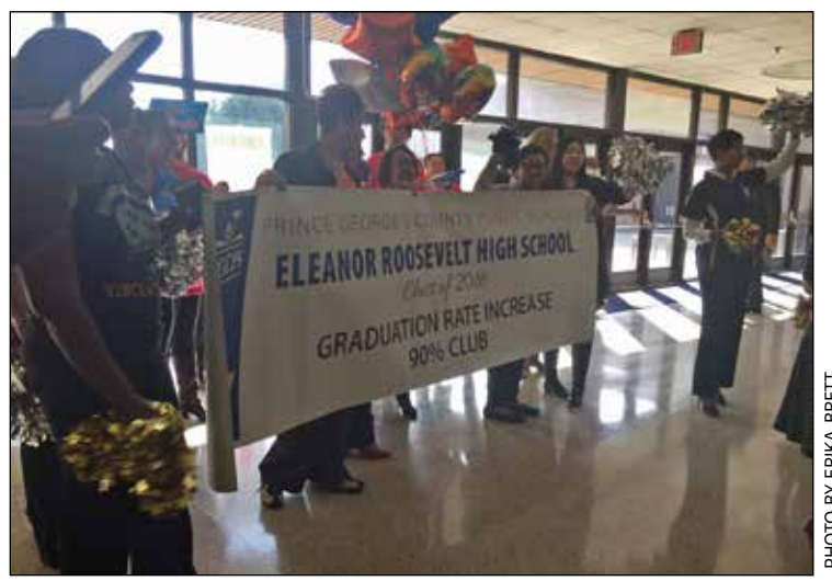
Prince George's County School Superintendent and staff celebrate Eleanor Roosevelt High School's achievement of a greater than 90 percent graduation rate.

Eight high schools in Prince George's County saw graduation rates rise above 90 percent in 2016, among them Eleanor Roosevelt, where a surprise party last Thursday celebrated the achievement.