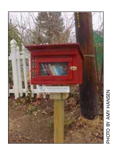
Little Free Library Forestway

rated for the holidays, wired with lights or painted by community members. Once placed, they can be officially registered and added to an online map. The person who places and is responsible for a Little Free Library is referred to as a steward. And as with any informal movement, there are little free libraries that do not show up on the national map, either because their stewards did not register them or because of a technical snafu. However, the concept is the same. Books are there to be shared.