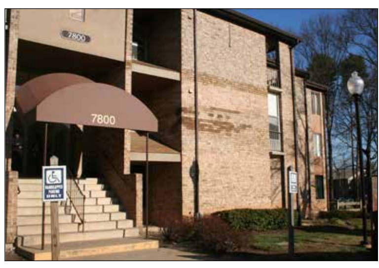
The fire in this Greenbriar building displaced families.

were forced to attack the flames from the perimeter because the interior was too dangerous to access. Over 100 firefighters from throughout the area fought the