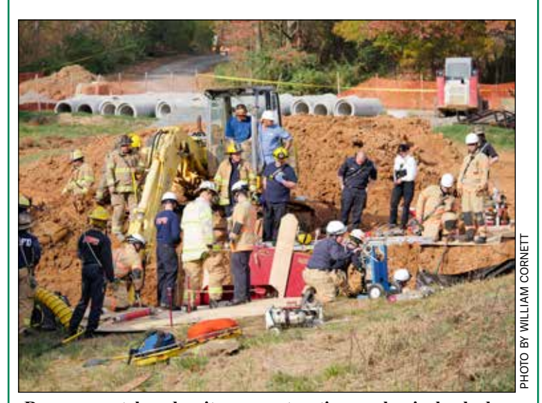
Rescuers watch and wait as a construction worker is slowly dug out of the mud after the trench collapsed around him.