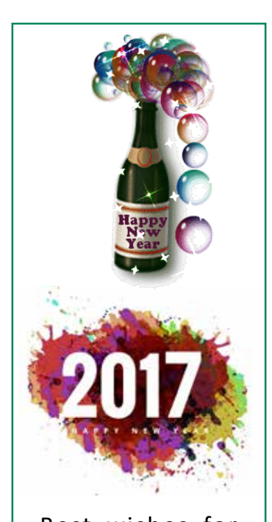
Best wishes for the New Year from the Staff of the Greenbelt News Review

A second collection of 25 unwrapped Toys for Tots was delivered to a Toys "R" Us drop box.