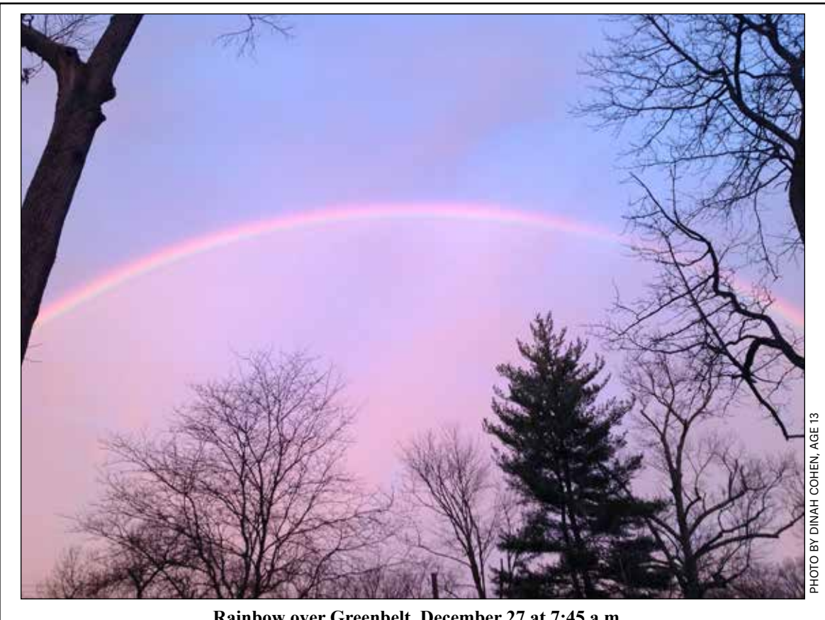
Rainbow over Greenbelt, December 27 at 7:45 a.m.