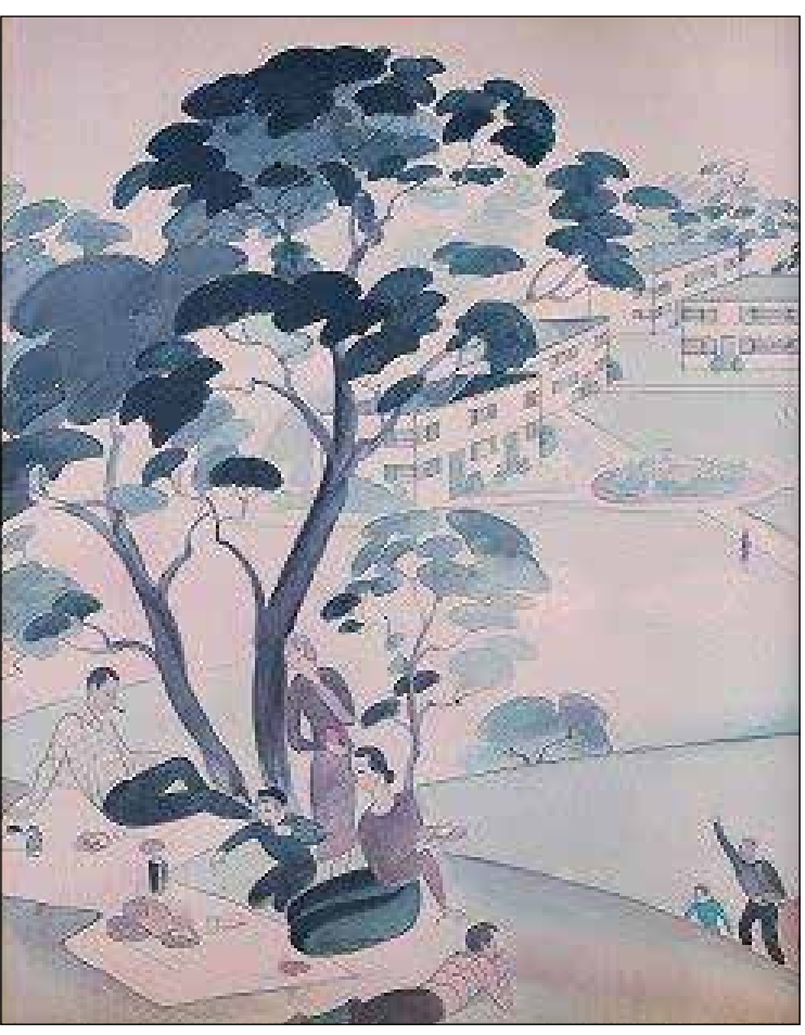
"Utopia" by government artist Aurelius Battaglia

This photograph of an artist's painting of the to-be-built lake is in the Library of Congress Greenbelt Project files.