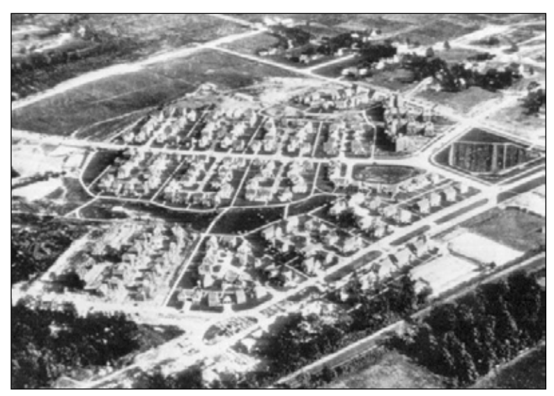
Aerial photo of Radburn, New Jersey

A unique design feature of Radburn was its pedestrian underpasses of main streets, which are present in Greenbelt.