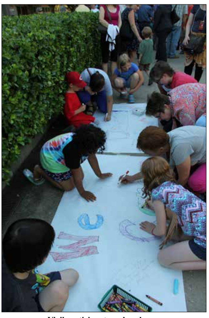
Vigil participants make a banner.

that are already in the Greenbelt pledge, ideals of tolerance and equality. "This is our family," he said, referring to the people in Orlando and the people standing next to him. "We owe it to one another."