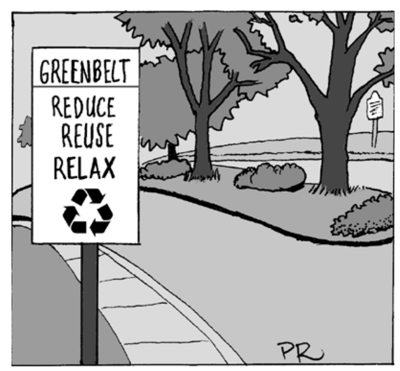
Cartoon by Peter Reppert

Summer Series: THE LORAX (2012) (PG) (95 m.) Thur. 1:00 PM FREE!