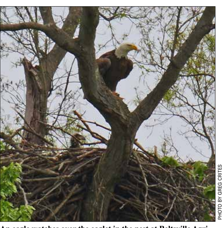
An eagle watches over the eaglet in the nest at Beltsville Agricultural Research Center.