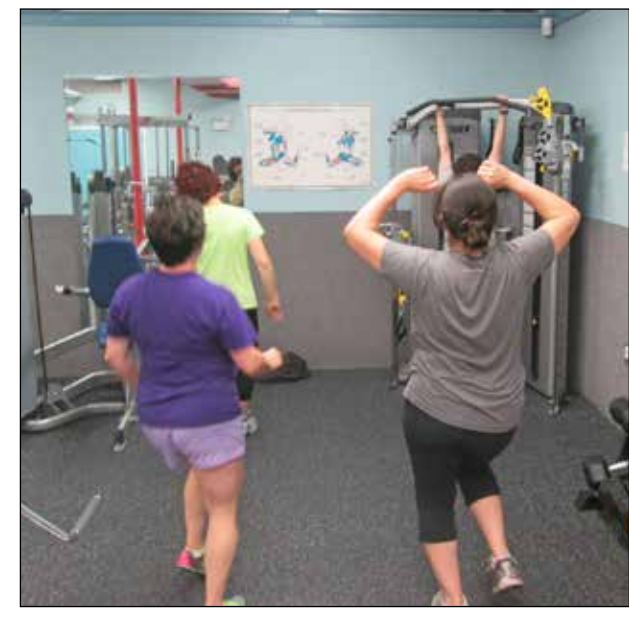
Participants from Li'l Dan's Fitness Boot Camp enjoy a cardio blast segment.