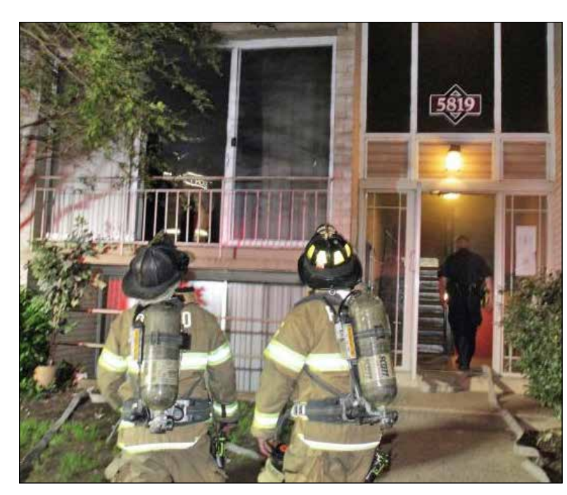
Firefighters from around the Greenbelt area battled two fires at the Franklin Park apartments.