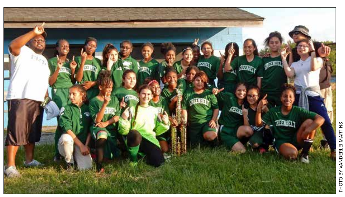
The Greenbelt Middle School girls soccer team poses after their championship victory.

Prince George's County Fire Department officials ask that anyone with information about these fires call the Arson Tip Line at 301-77-ARSON (301-772-7766).