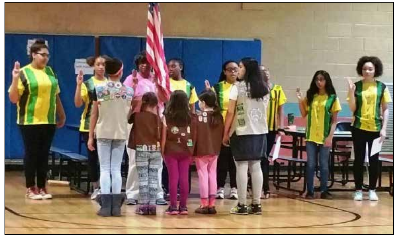
Girl Scout Troop 2065 holds a Flag Ceremony on Thinking Day 2016.

World Thinking Day is an international celebration of the World Association of Girl Guides and Girl Scouts. It is commemorated on February 22 in more than 146 countries around the world.