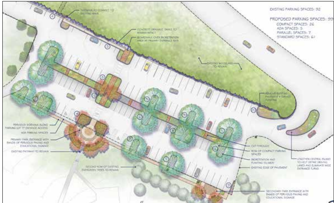
Parking Option 1