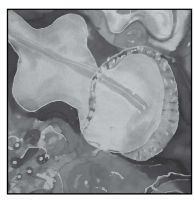
Make Me an Instrument of Your Music (painting on silk)

I've always been curious about what lies underneath everything. This curiosity is reflected in the