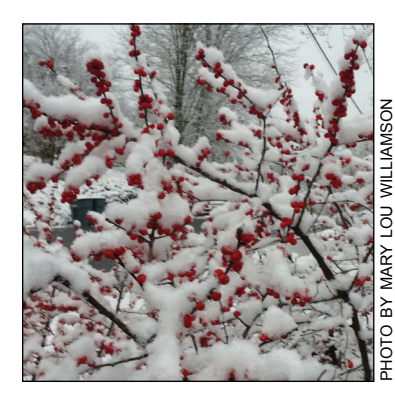
Red winterberries topped with snow.

More Community Events are located throughout the paper.