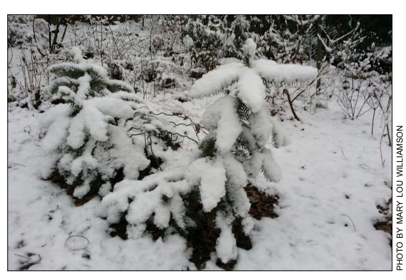
On Wednesday every branch was loaded with soft puffy snow.

But back to the drone. This was in 1946. Someone in the military unit was experimenting with a drone, which actually could fly not far, perhaps no further than ten feet. We thought it was wonderful. What use it might have we then had no idea. Obviously that question has been answered since and to a fare-thewell, as they used to say. And so, as another cliché from the past: time marches on!