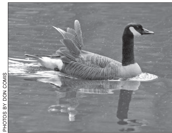
This goose has been swimming alone in Greenbelt Lake, showing damage to its wing, an example of "Nature Gone Wrong" that makes us appreciate it more when things go right.

In all, I counted 45 birds on the pond, belonging to 11 species.