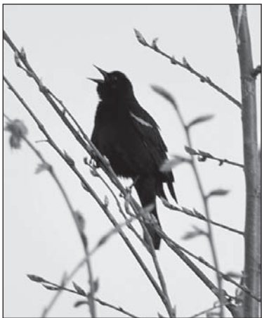
Male red-winged blackbird sings his characteristic trill at Ora Glen Pond.

I had decided to expand my birdwatching to other waterways of Greenbelt beyond Greenbelt Lake, so I would be less "Old Greenbelt-centric." My interest in red-eared slider turtles in an aquarium in my eye doctor's office on Hanover Parkway, diagonally across from Ora Glen Pond, caused one of the office assistants to tell me that every year ducks fly from the pond over Hanover Parkway to nest on the grounds behind the doctor's office. So Ora Glen Pond became my next bird watching scene. I didn't find