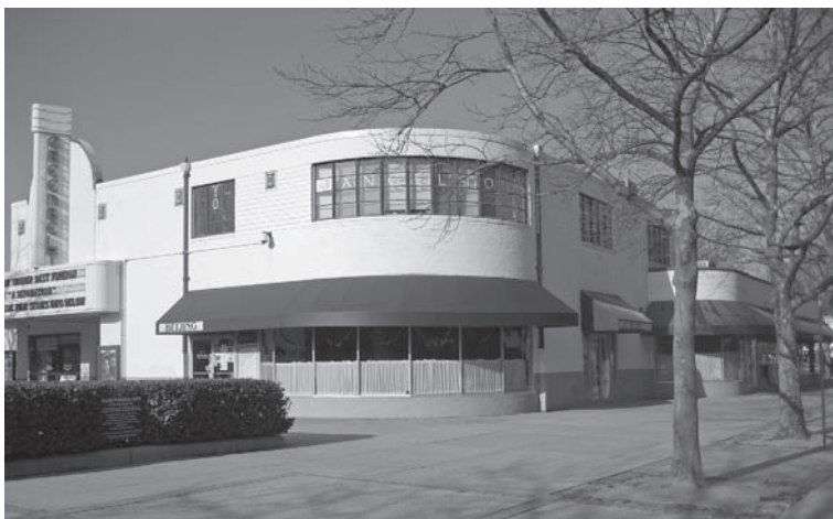
"What memory does this building have for you?" For example, were you a soda jerk working at the old Greenbelt drug store?

The Greenbelt News Review plans to publish a variety of