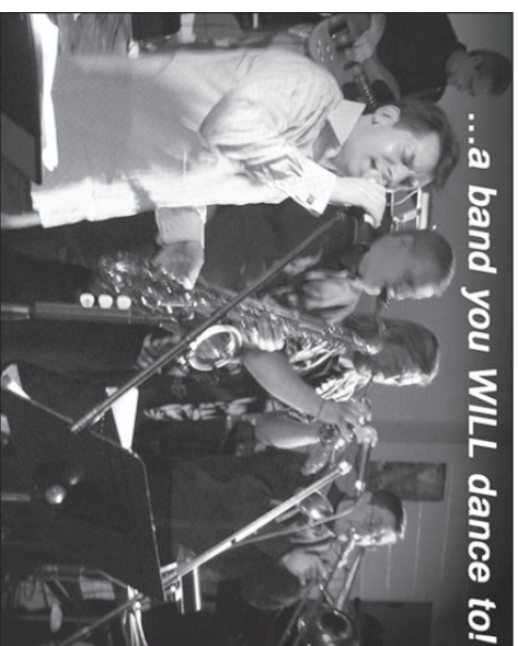
The CPR Band will take to the stage on Saturday, Sept. 3 from 7:30 to 10:30pm. Be sure to bring your dancing shoes!

7:30- CPR BAND 10:30pm Stage. Bring your dancing shoes! With a powerful three-piece horn section and a song list that's sure to get any crowd dancing, CPR makes events fun and memorable.