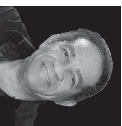
The Ernie Fields Motown Review will take to the stage on Sunday, Sept. 4 from 7:30-10:30pm.