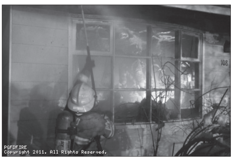
The fire at 108 Greenhill Road was believed to be started by candles.