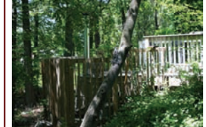
6K RIDGE ROAD

Enjoy an evening soaking in wood burning hot tub or wood burning fire inside. One of a kind home!