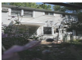
6Z1 PLATEAU PLACE

Very motivated seller is preparing home for market. Bathroom being totally renovated.