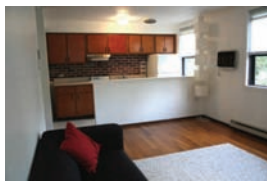
9G LAUREL HILL RD.

Bright, cheerful upper one bedroom home with private entry. Tree top view. Glistening floors.