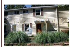
14J LAUREL HILL

Three season porch added to this home and a wonderful Garden-house/ workshop. Seller preparing home for