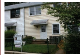
73S RIDGE ROAD

Floors will be gleaming, a new deck will be built, walls painted and new kitchen & bath flooring will await you. 3bedrm.