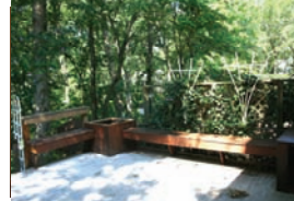
6L PLATEAU PLACE

Incredible outdoor entertaining area on deck overlooking woodlands. Upgrades!!! Two bedroom frame townhome.