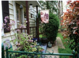
44T RIDGE ROAD