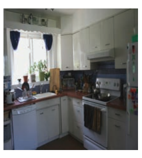
1-D Southway OPEN SUNDAY 1:00—3:00PM.

New Listing! First show- Pergo flooring in living