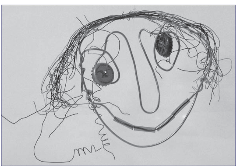
Greenbelt Artist-in residence Marla McLean leads a workshop on how to make a mobile with wire and recycled materials at the July 6 Artful Afternoon.