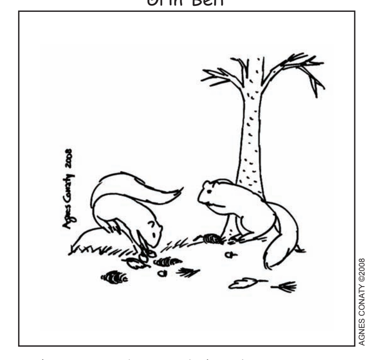
"I'm turning three and I'm a leap year baby. Go figure out the math."