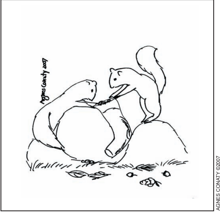
"What do you mean pinecones are just stocking stuffers?"