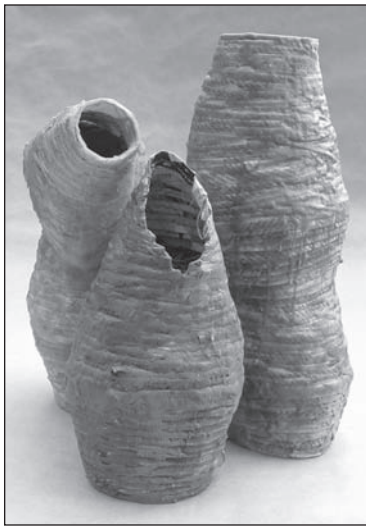
Morissette's "Villi Cluster"

Following the reception the Greenbelt Museum will host