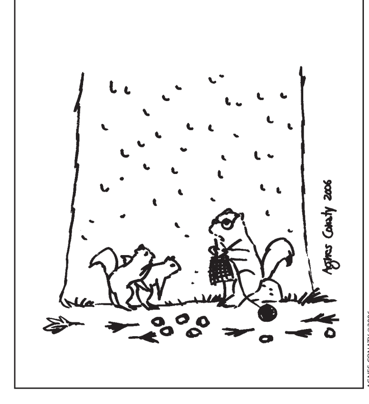
"Gone are the days when all we wished for as a present was a nut cracker."