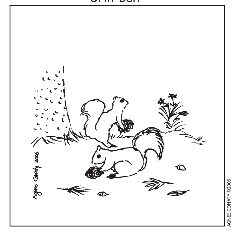
"Ummm . . . this is a good one. Should I eat it now or save it for Thanksgiving?"