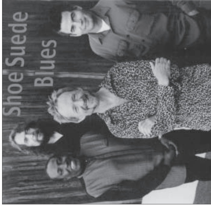
"Shoe Suede Blues" featuring Peter Tork of "The Monkees" fame (center) will be on hand Monday from 12 Noon to 3pm.

SPECIAL REMINDER: The "All You Can Ride Wristband" vouchers are available for $7.00 at Co-op until Noon on Friday, Sept. 2. These vouchers can be redeemed at the Festival for the $15.00 "All You Can Ride Wristband."