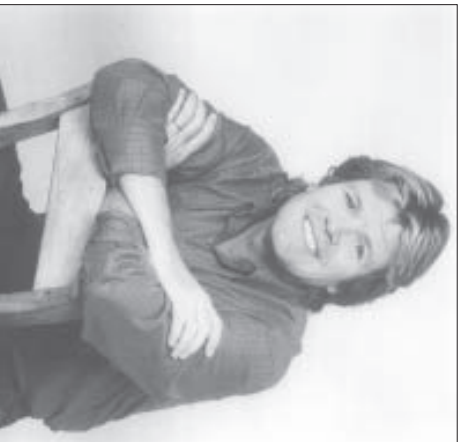
Peter Noone and the rest of "Herman and the Hermits" will perform all of the old favorites on Sunday from 1 to 3pm.