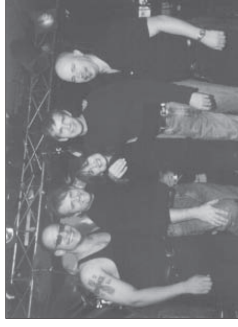
"Diamond Alley" will be on hand Friday night from 9 to 12 Midnight.