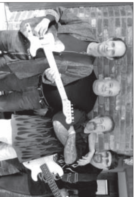
"Nighthawks" will get you movin' and grooving' to their blues tunes on Saturday night from 9 to 12 Midnight.