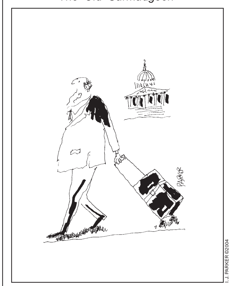
"Gas prices, security measures, air fares . . . I think I'm better off vacationing in Greenbelt."