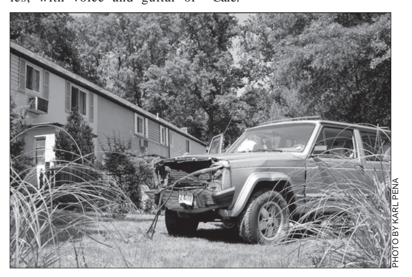
Jeep Cherokee in the yard of the end townhouse in the 9 court Ridge Road after hitting two cars, driving through two yards while flattening a fence, hitting posts and trees and turning around before coming to a stop at the doorway of the house.

In case of heavy rain, the music will move into the New Deal