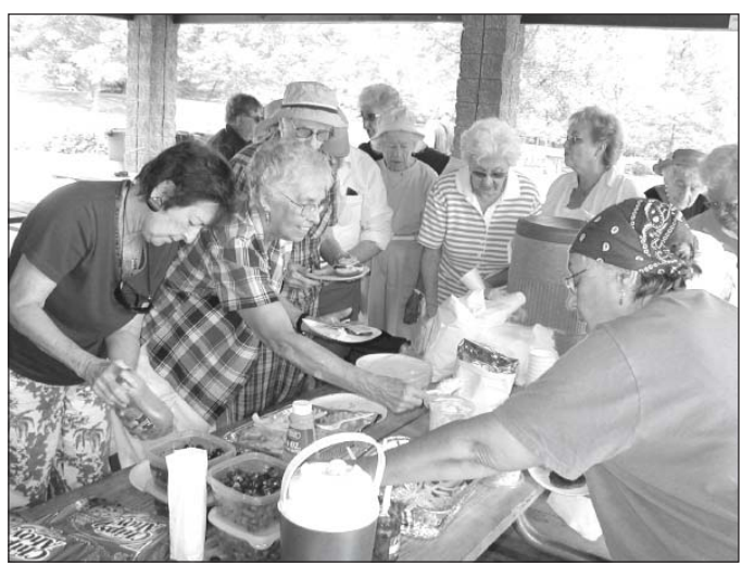
Once the food was ready, the seniors quickly loaded up their plates.