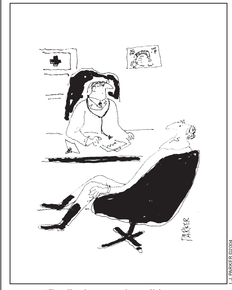
"I'm allergic to expensive medicines . . . my wallet breaks out in a rash!"