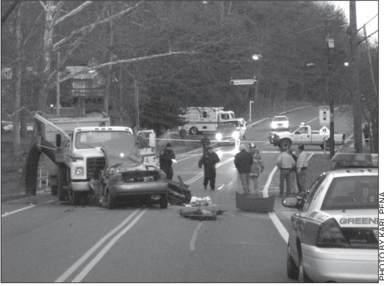
The two door Honda Civic smashed into the public works truck on Crescent Road Tuesday afternoon at 3:45 after crossing the double yellow center line near St. Hugh's school.