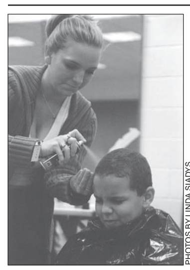
The children enjoyed a chance to get a "wacky hairdo."