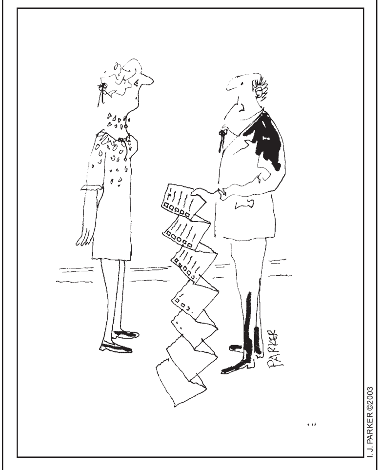
"It's my absentee ballot from California."