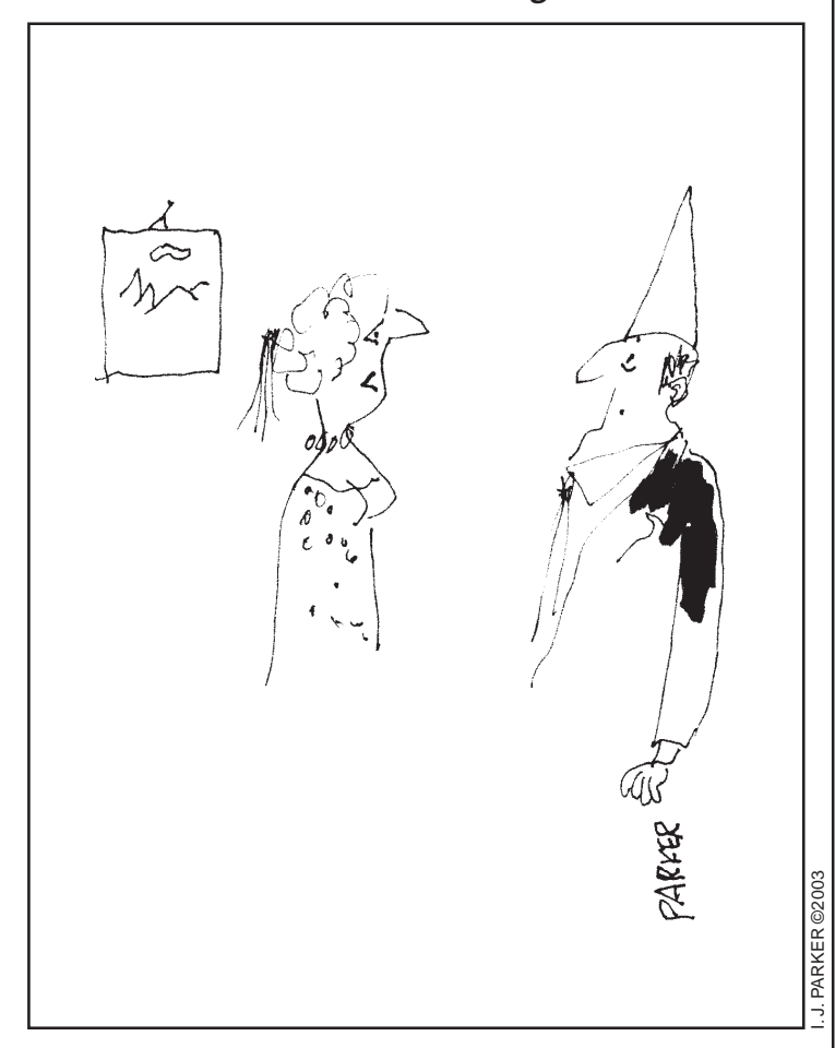
"There's a City Council election soon. Why don't you throw your hat in the ring?"