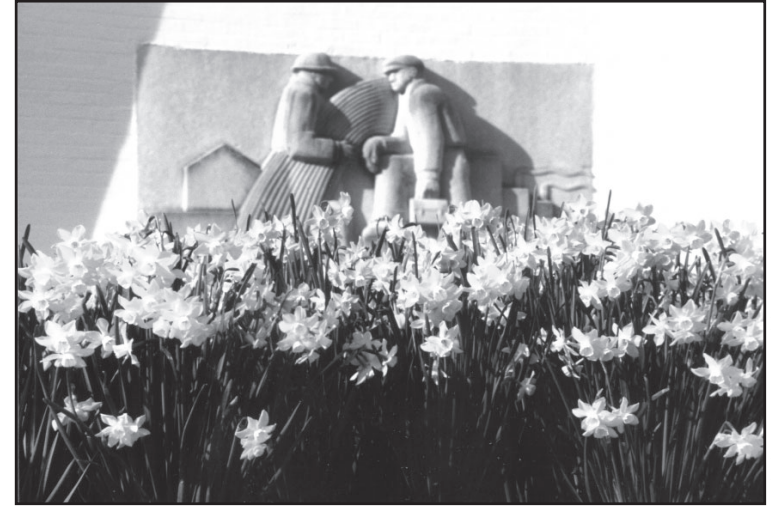
Bed of sunny daffodils grace the Bill of Rights bas-relief at the Community Center.

For information, call Greenbelt's city clerk at 301-474-8000 and arrange to pick up an application. Applications must be completed and returned to PGCMA no later than April 30.