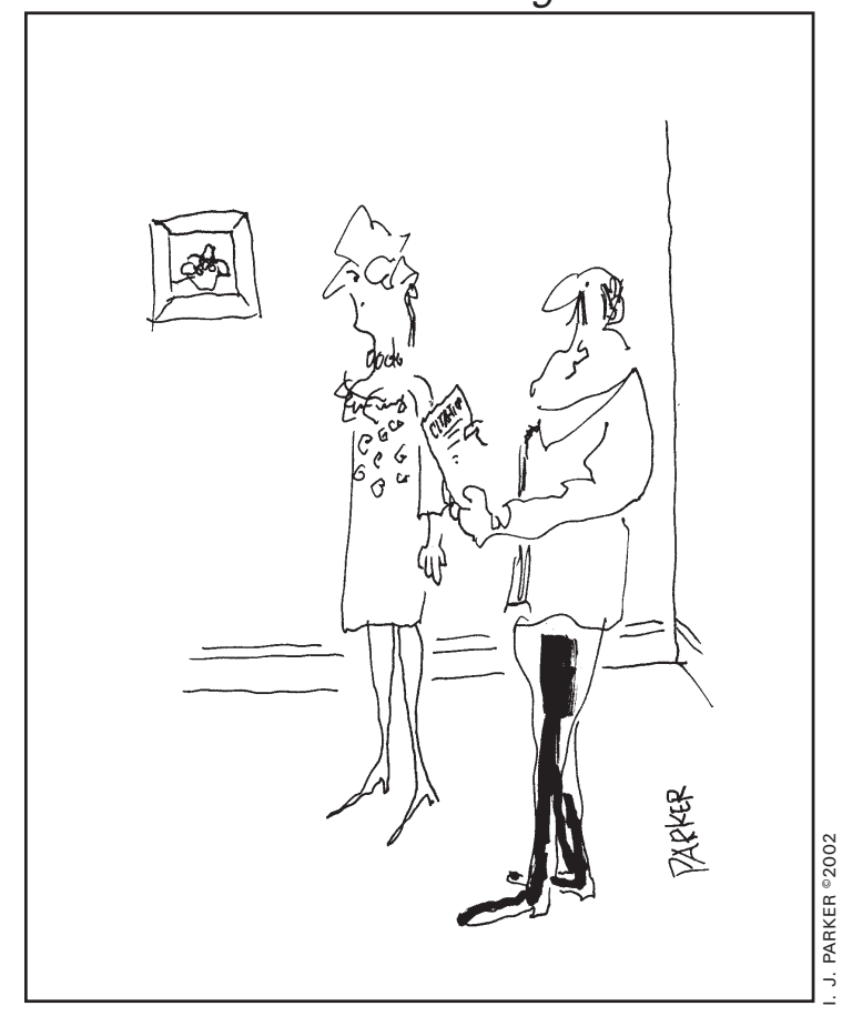
"It says I ran a red light . . . and that my contribution to the city budget is appreciated!"