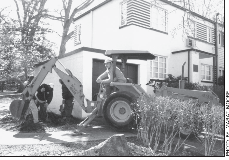
remove plants that were considered too modern for the museum's historic garden. On a recent day the crew included supervisor Brian Townsend, Robert Tripe, Lewis Carroll, and Curtis Dudley.

The finished quilts were displayed in the halls for viewing by other students and parents at the multicultural dinner. ELOB encourages the presentation of the final results to parents and the community ("authentic audiences") to encourage better quality results.